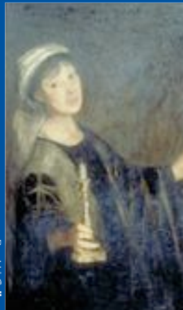
Ben Uri Gallery